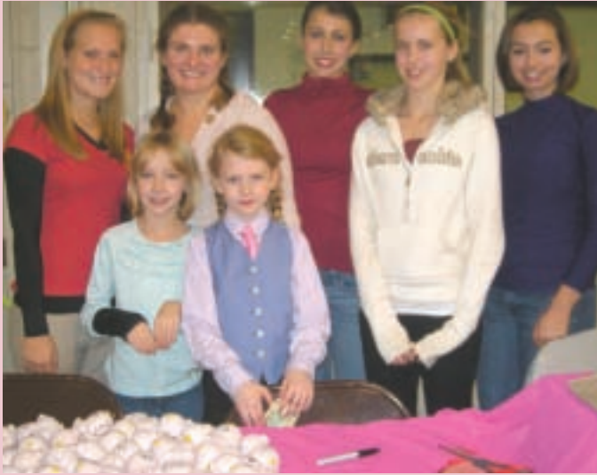
The Pride from LionHeart Riding Academy.